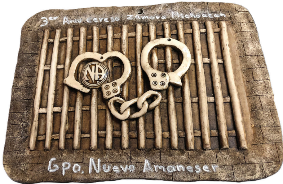
2018 Group Anniversary Art, Mexico