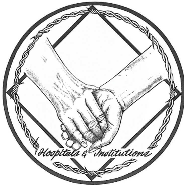
MC, Location Unknown