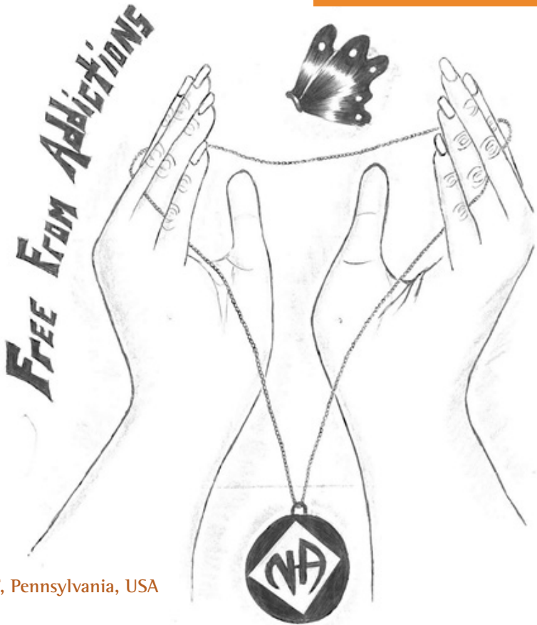
TF, Pennsylvania, USA