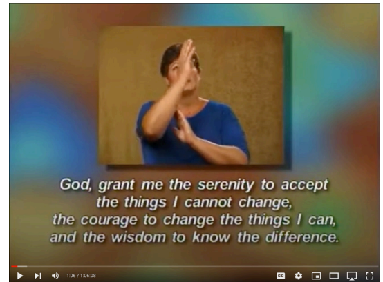
Screen shot from ASL Version of LWB

Virtual meetings that are accessible may also wish to consider cooperating with service bodies that are attempting to build relationships with organizations that provide services to addicts with additional needs.