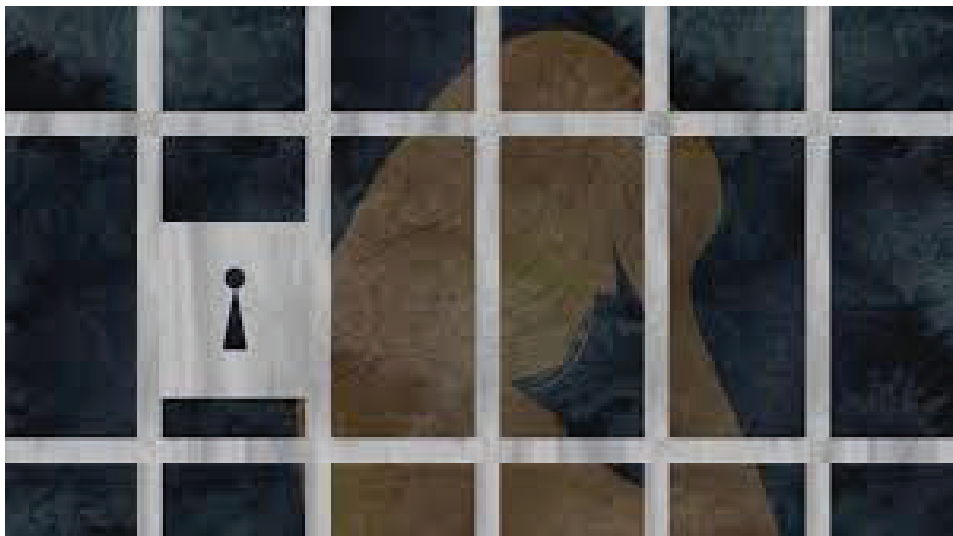
Anonymous Inmate Art

If you would like to see your art printed here, please send jpegs or pdf files to Handl@na.org , or mail to Reaching Out; c/o NA World Services; PO Box 9999; Van Nuys, CA 91409.