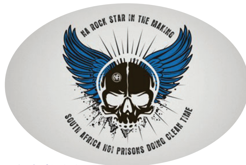
South Africa H&I