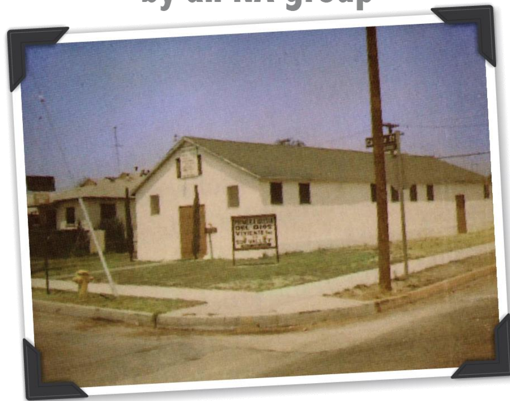
Sun Valley, California, USA 5 October 1953