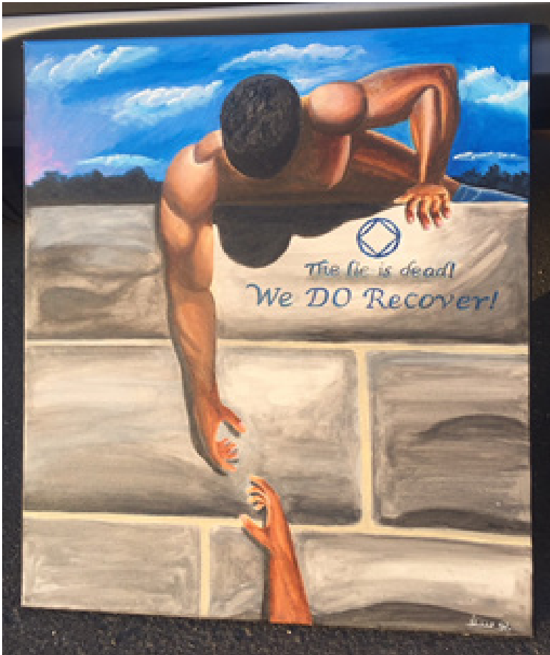
Folsom State Prison, California