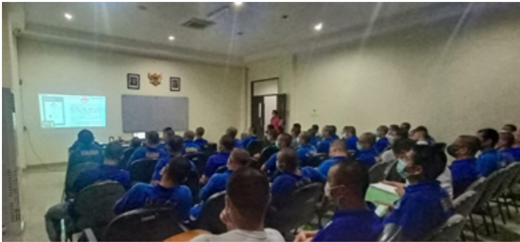
H&I meeting in Indonesia