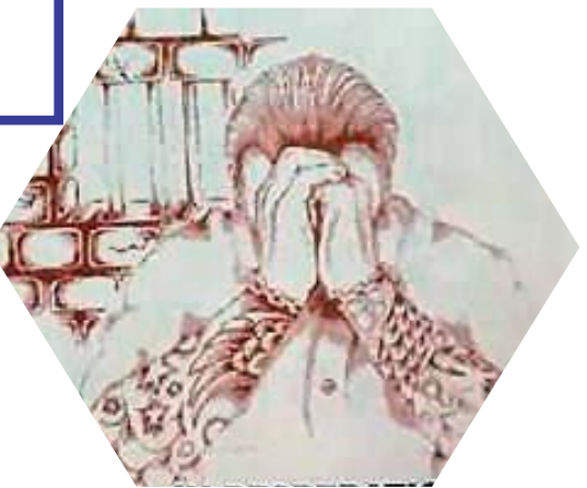
In Desperation... California, USA