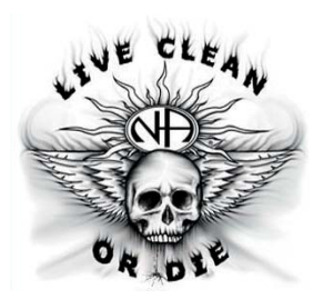
Front & back T-Shirt, Unknown Source

wake up before it is too late. May you all live free. It is time to spread your wings. DW, SW, USA