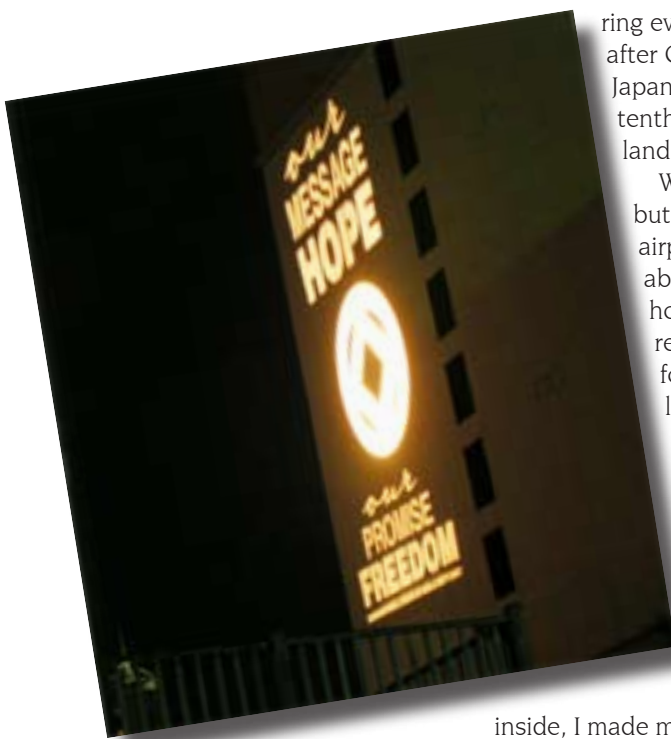
WCNA-32 theme projected on a building, just outside of Sunset Station, the site of the convention kick-off festival.

My volunteer shift in merchandise didn't start until 7:00 pm, so I had time to socialize, find a sponsee, meet more people, and collect more hugs. The energy of recovery carried me through a blur of workshops, volunteer commitments, step work with sponsees, comedy shows, and speaker meetings. My time as a cashier in merchandise allowed me to hug addicts from Bahrain, Kuwait, Brazil, Colombia, Canada, and Japan, as