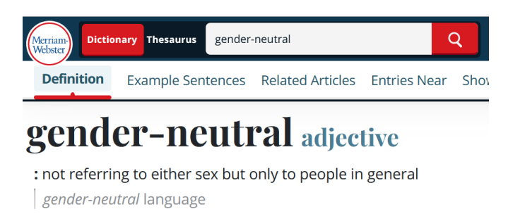
Slide: So what does gender-neutral mean?

So, what does gender-neutral mean? In terms of the English language, it means using words that do not refer to one gender only. For example, a gender-neutral approach in English would be to use the word "people," "addicts," or "members" instead of the phrase "men and women."